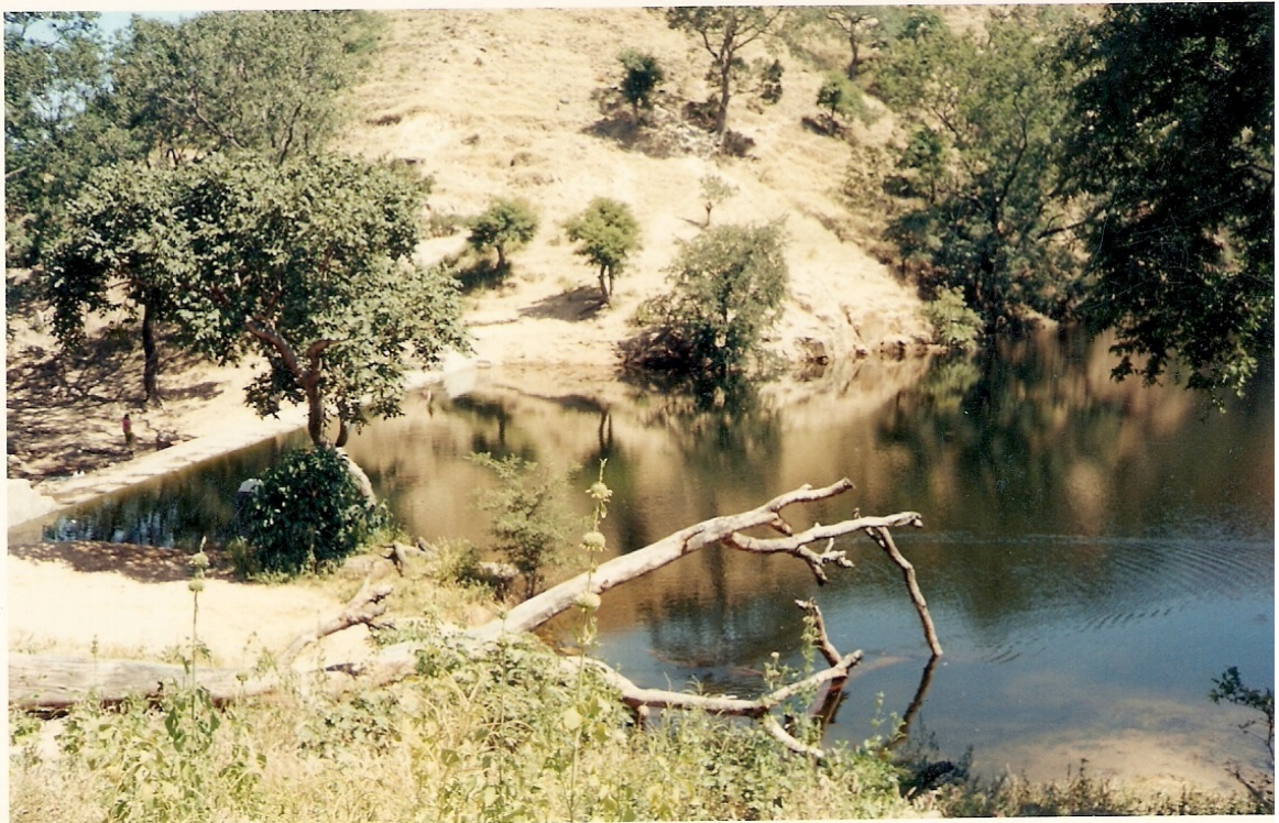
The storage area of Neyertete dam(2001)