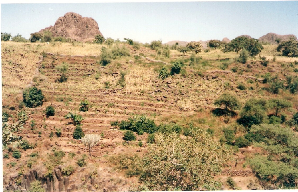
Cultivating fruit trees on terraces on very steep slopes at Dursa area (2500m.a.m.s.l.)2003