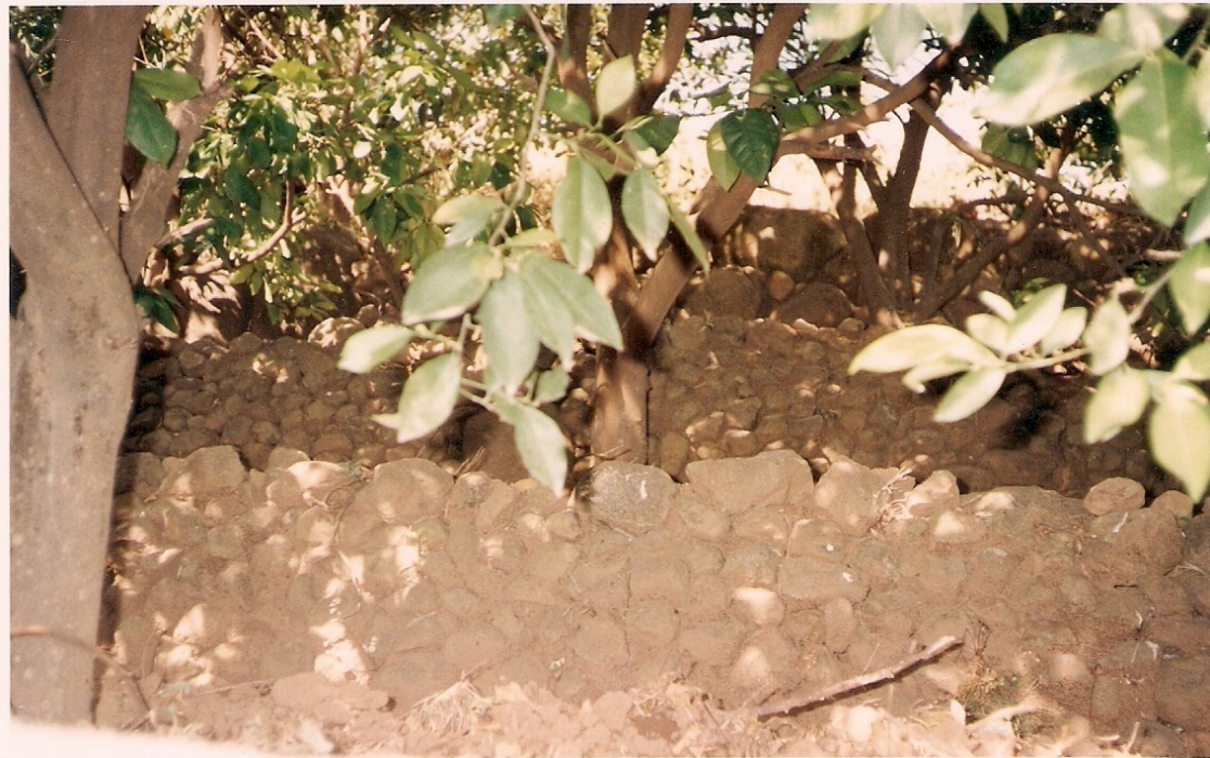
A close-shot photo at Sorrong area to show stone size and a good building style of terraces To cultivate Mango trees. (2500m.a.m.s.l.) 2003.