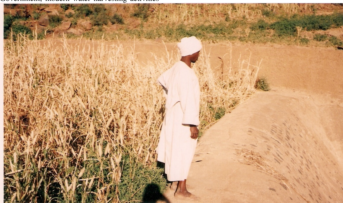
The man is standing on the Golo dam, and the storage area was silted completely and cultivated by Millet (2001)

During a visit to the area in 2001, the dams at Golo, Tur and Shawfugu sites were considerably silted up after a few years (as the natives said). Because they were built without gates to pass the eroded materials (see the photo).