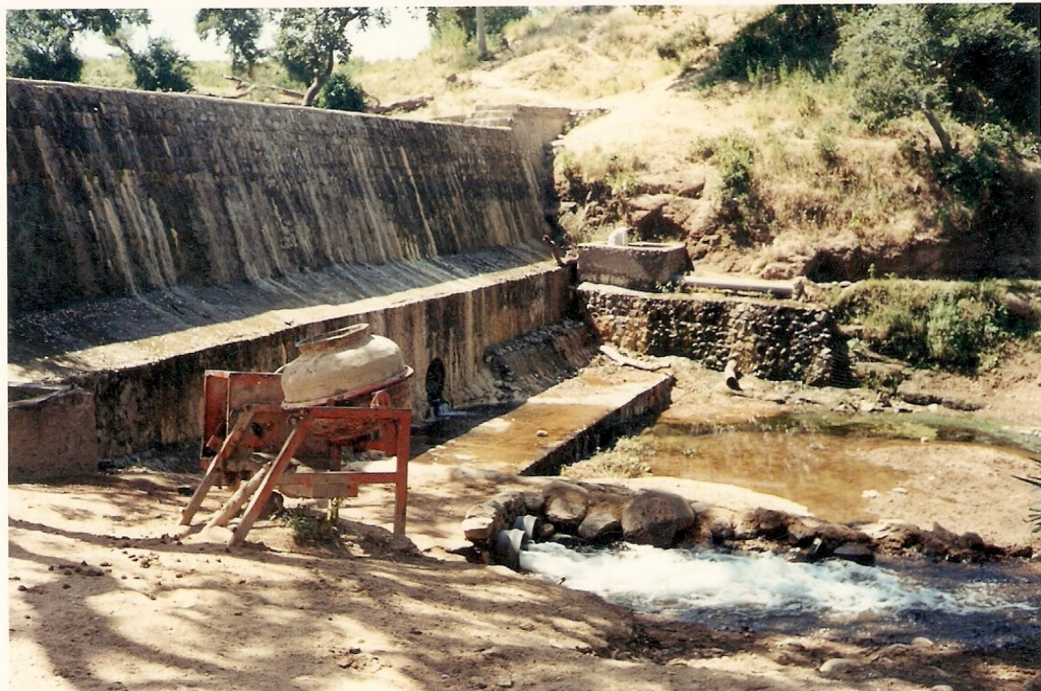
The central gates appear at the bottom of Neyertete dam body.