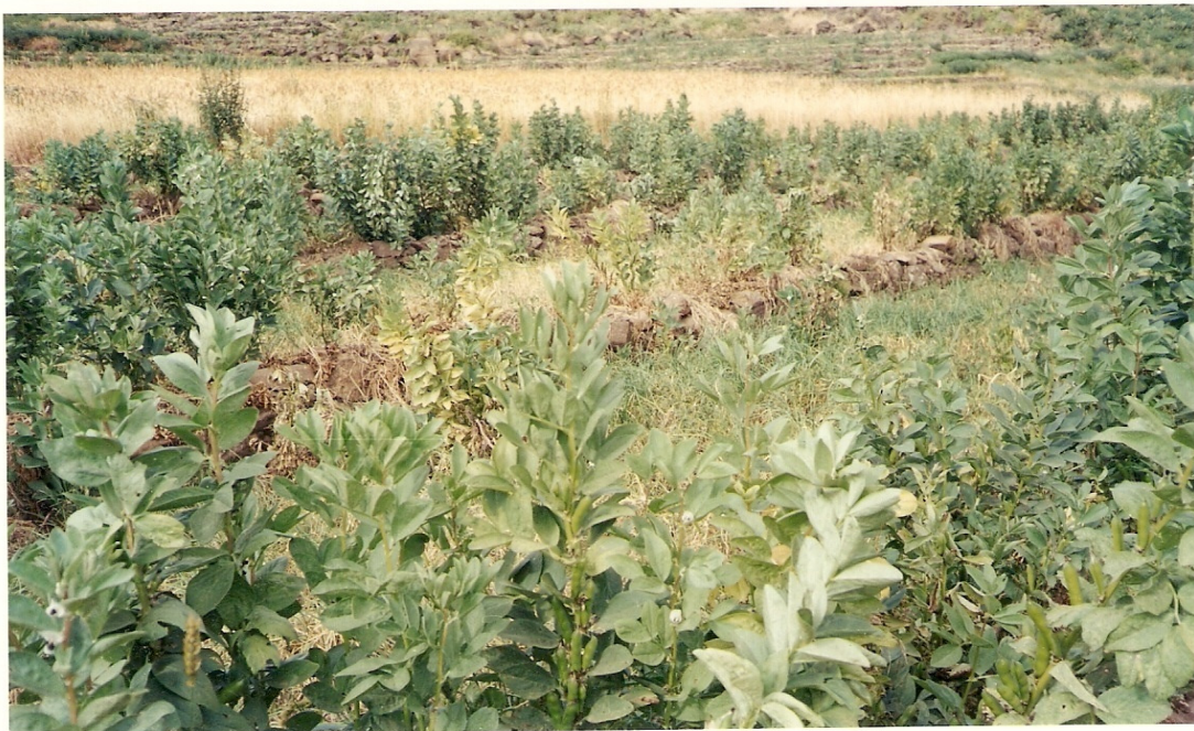
Cultivating Beans and Wheat on terraces on a gentle slope areas at Logi area (2800m.a.m.s.l.) 2003.