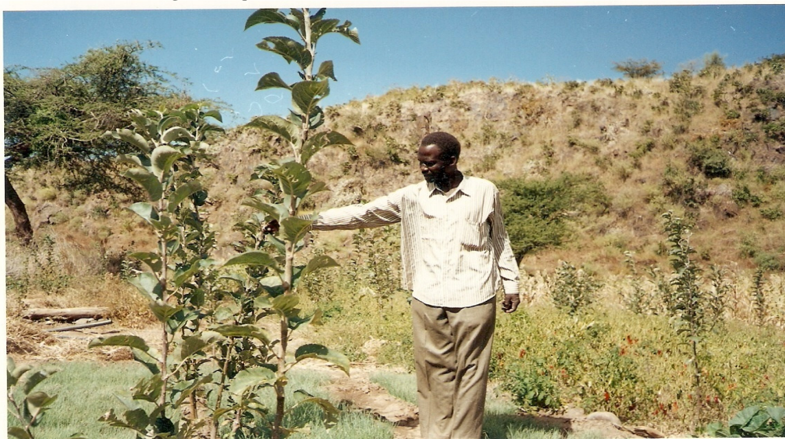
An open hand-dug well at the left side of the photo uses to irrigate onions, red papers and apples at a depression near Kairu village (2400m.a.m.s.l.)

Also people extract water from aquifers by means of hand pumps installed in bore wells at Golo area (2300m.a.m.s.l.) , (a visit to the area 2001).besides, there are many open hand dug wells supply villagers with water for domestic use, animals drinking and irrigating fruit gardens and field crops. (see the photo).