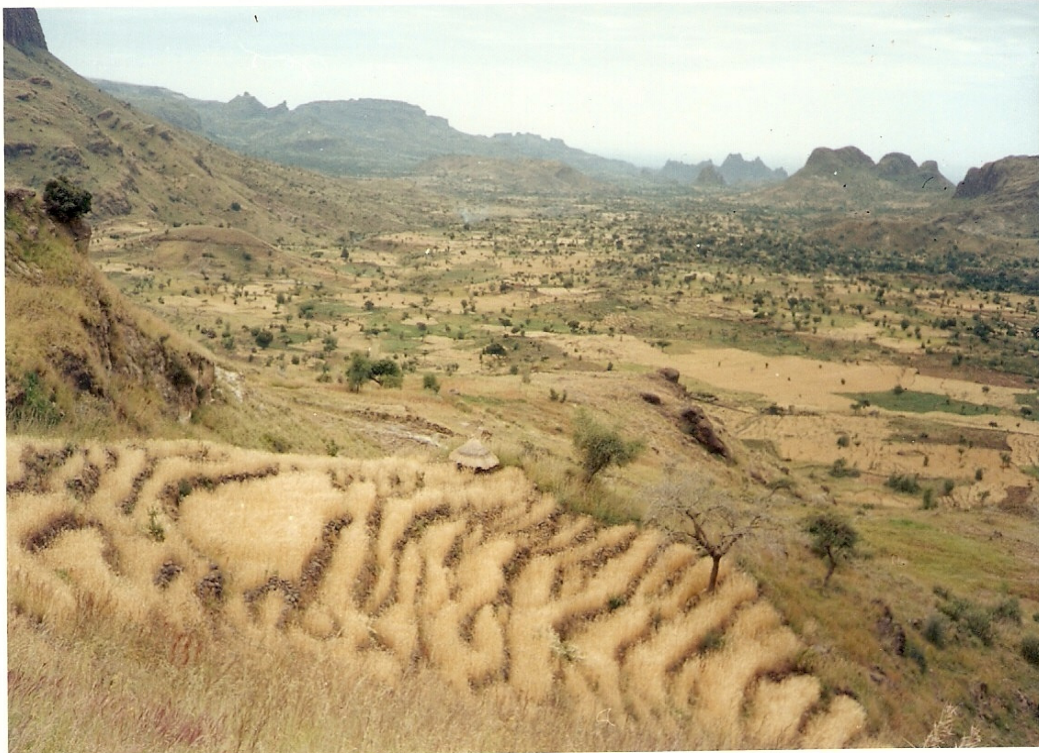
Cultivating wheat on terraces at Kairu area (2500m.a.s.l.) 2003

The origin of the terraces suggest links with both West Africa ( for example , the Joss plateau of Nigeria) and Southern Arabia ( the well tiered nature of some terraces is very similar to those in